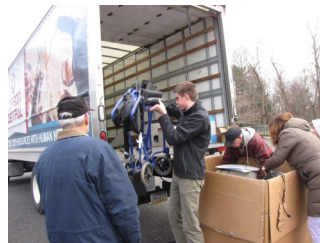
Loading up computer and medical supplies for Mission Central