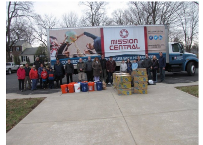
Day of Service Volunteers—everyone worked really hard and we appreciate it