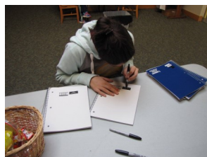
Prepping notebooks for school bags