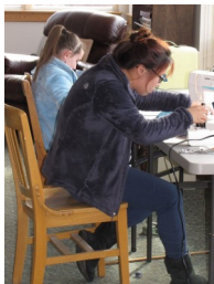
Sewing school bags